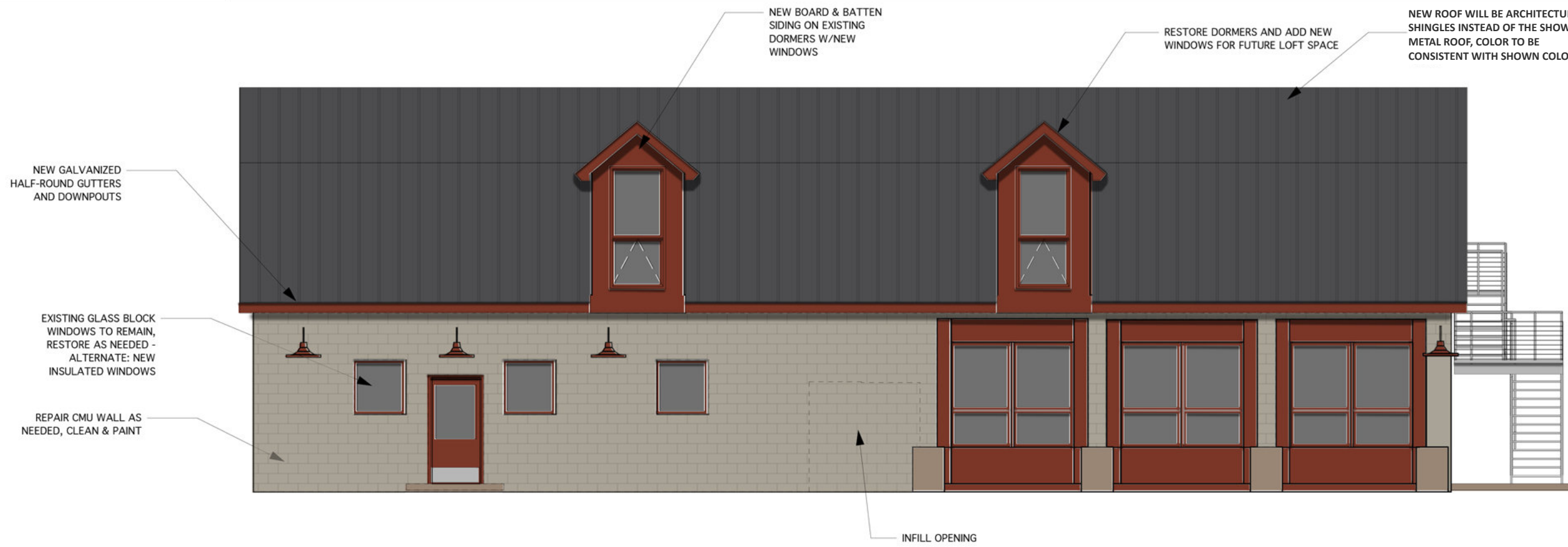
6 SOUTH ELEVATION Scale: 1/8" = 1'-0"